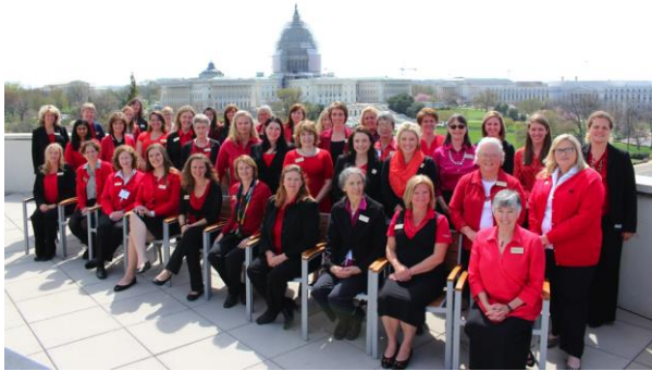
Photo Above: Women's Mining Coalition 2015 Fly-In. Get details about last year's Fly-In here .

The WMC will once again travel to Washington, D.C. this April to meet with members of Congress for its 24th annual Fly-In. Read our latest blog post and learn more about the WMC's annual Fly-Ins here .